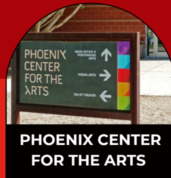
PHOENIX CENTER FOR THE ARTS

If your child requires after-school care Monday through Friday, but their chosen program doesn't run all five days (for example, it meets only one day), we suggest registering them for another program offered M-F to ensure full-week coverage.