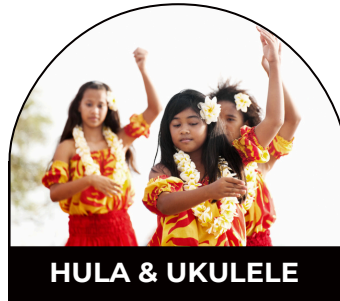
HULA & UKULELE