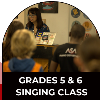
GRADES 5 & 6 SINGING CLASS