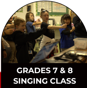
GRADES 7 & 8 SINGING CLASS