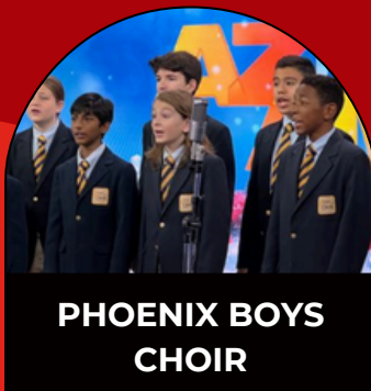
PHOENIX BOYS CHOIR