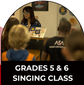
GRADES 5 & 6 SINGING CLASS