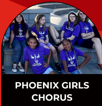
PHOENIX GIRLS CHORUS