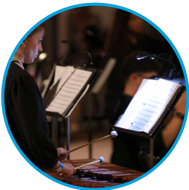
$50 1 MUSIC STAND