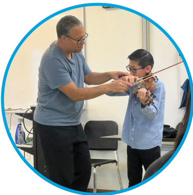
$250 1 GUEST ARTIST + MASTER CLASS