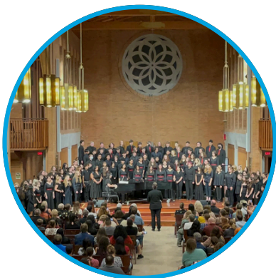
$2,500 1 VENUE RENTAL

Here are a few examples of how the arts departments count on your generous support during the school year: