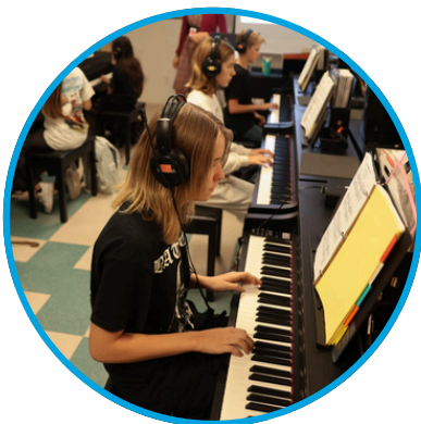
$300 1 PIANO TUNING