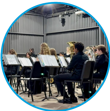
$1,600 1 CONCERT'S SHEET MUSIC