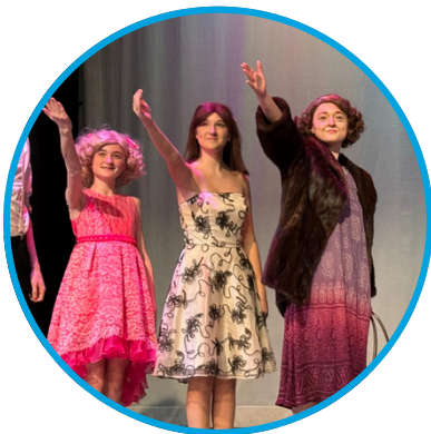
$4,000 2 THEATRE LICENSES